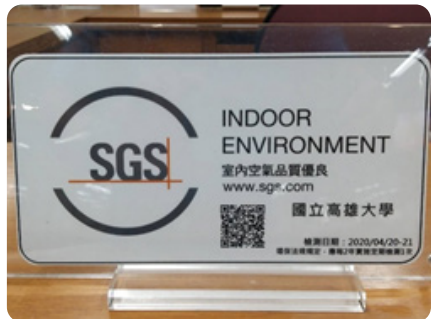
Indoor air quality real-time monitoring panel